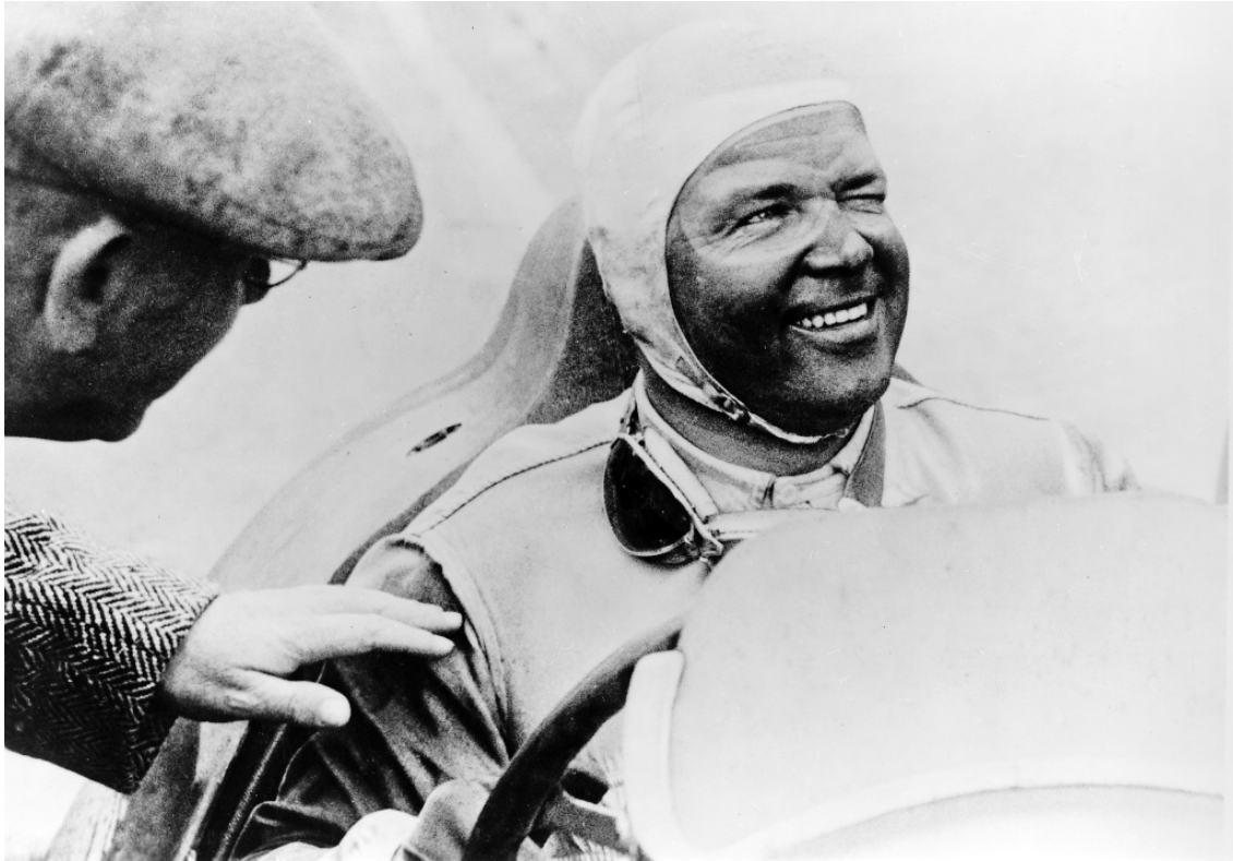
Rudolf Caracciola, 1938

Like the SLS AMG model today, many prospective buyers of the SSK model wanted the high-performance Mercedes-Benz offered, but not in a race-ready package. That is why some SSKs were ordered with a cabriolet body, something that is still in the cards for the modern SLS AMG. Just as Mercedes-Benz was happy to customize your SSK in 1928, AMG will be happy to customize the performance of your SLS AMG today.