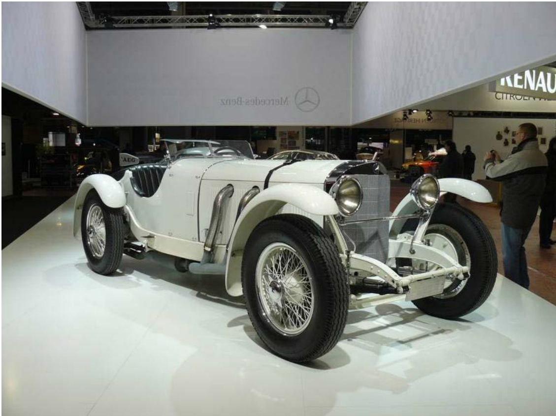
1928 Mercedes-Benz SSK

supercharged 7.1-liter engine. Over the SS model, the SSK added power and shortened the chassis from 133.9 inches on the SS to just 116.1 inches on the SSK.