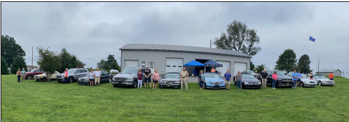
Prior picnic picture.

We always have great fun, including people's choice car awards! We'll send out an eBlast with more details before the event!