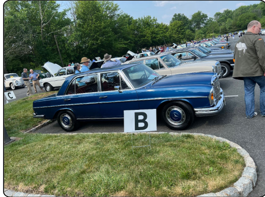
Top 2– row of Pagodas from different ends Bottom 2 - some more interesting MBs photos courtesy of Alice and Otto Christensen