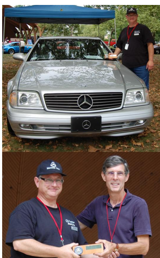
For coverage of MBCA-NEPA events: www.mbca-nepa.org/past_events/ default.aspx