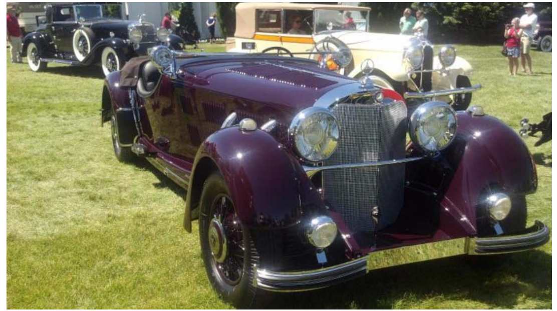
Best in Show at Elegance at Hershey

The Elegance at Hershey Sunday June 12, 2016 was the 6th annual "The Elegance at Hershey". NEPA members enjoyed seeing about 75 invited automobiles from around the country, rare and limited production models of varying car companies displayed against the beautiful backdrop of the Hotel Hershey. Proceeds from this event went to find a cure for Juvenile (Type 1) Diabetes (JDRF), the AACA library & Research Center, and the AACA Museum. We were pleased that the Best of Show award went to a 1934 Mercedes-Benz 500K Roadster from the Miyabi Collection, Honoluu, Hawaii (picture shown). Designated model W29 by M-B, production continued through 1936. Its heart was a Roots-supercharged 5.0-liter/160hp ohv in-line eight-cylinder engine - thus its 500K designation - 5.0 litre engine with Kompressor (supercharger in German). This one-off example was featured in the 1938 German movie Der Blaufuchs (Blue Fox). While in Estonia in the late 1940s, it was fitted with a trailer hitch to haul firewood! It first came to the U.S. in 1987. Restoration was completed July 2015. Don't miss next year's Elegance the second weekend in June.