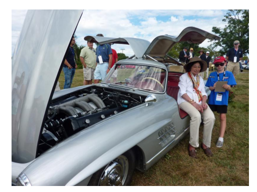
1956 300SL Gull

On October 8, my mom and I went to the AACA Hershey Fall Meet. It's the biggest car show in the world. I judged 5 old cars with about 10 other Hagerty Youth Judges. My favorites were a 1908 Cadillac and a 1958 BMW Isetta. Afterwards, I had chocolate milk at Hotel Hershey. See you next year.