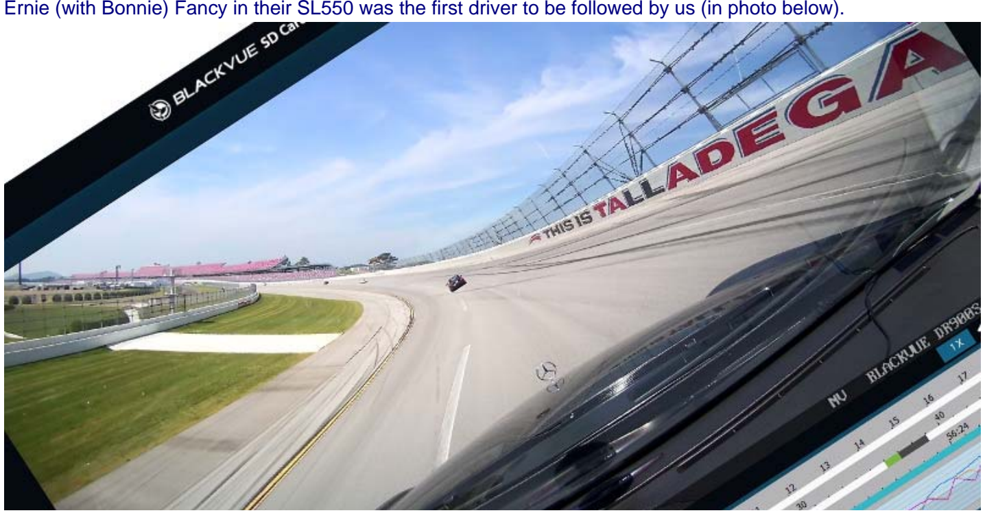
(Dashcam screen capture tilted 33° to present the perspective of the steep 33° banked turn.)

Sunday morning, we awoke early to head to Talladega Superspeedway for the Autobahn Experience led by a pace-car with no passing. This track is known for its 33 degree banked turns and when the car reaches 110 mph, the driver can take hands off the wheel and the car stays centered on the track throughout the turn! About a dozen cars were in each grouping and the older or slower cars were grouped separately to allow for each car's ability or driver's comfort level. This was an awe inspiring experience! That first banked turn felt as if the car was going to take off like an airplane. The sky to the right made us feel airborne. As we came around the back turn, an American Flag was on a pole to the right, and the way the car approached it on the banked turn raised goose bumps down my arms and was a glorious sight to witness. We informed the drivers that were in front of our vehicle that we would be recording their laps with our new Dashcam, and our MBCA-HudMo Regional Director Ernie (with Bonnie) Fancy in their SL550 was the first driver to be followed by us (in photo below).