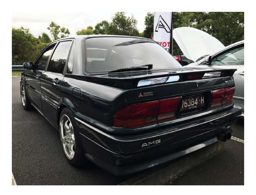
Figure 1: 1989 Mitsubishi AMG Galant

The VR-4 is a legend in automotive history. It was the Galant's performance version. It is also the car that forged the way for the iconic Lancer Evolution. Before Mercedes acquired AMG, the tuning company had built an AMG-badged Galant for the Japanese market.