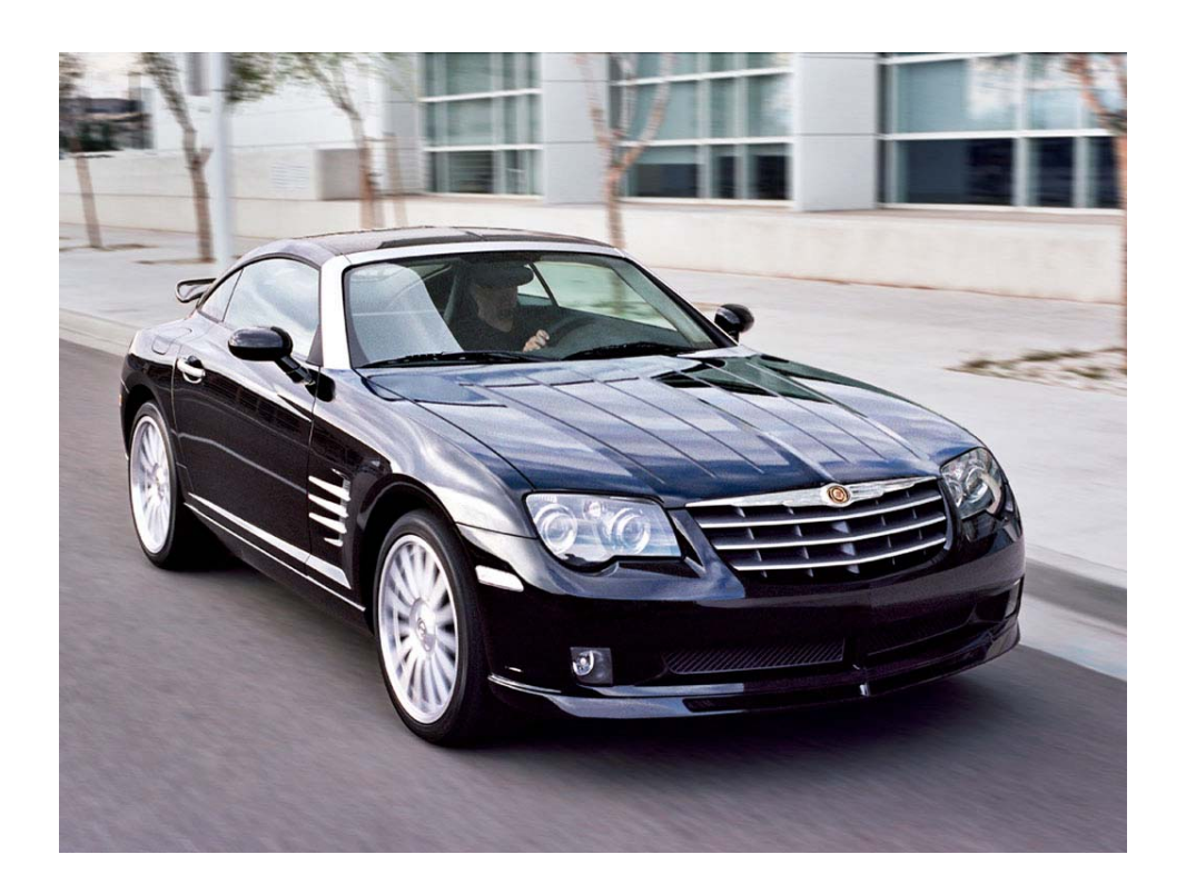
Figure 2: 2005 Chrysler Crossfire SRT-6

Under the Crossfire shell lies the first-generation Mercedes-Benz SLK roadster platform. Being an American vehicle, fans of the Street & Racing Technology cars expected the Crossfire SRT-6 to be powered by an American engine.