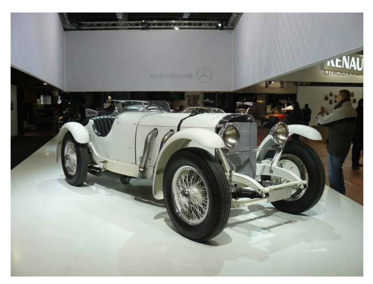
1928 Mercedes-Benz SSK

supercharged 7.1-liter engine. Over the SS model, the SSK added power and shortened the chassis from 133.9 inches on the SS to just 116.1 inches on the SSK.