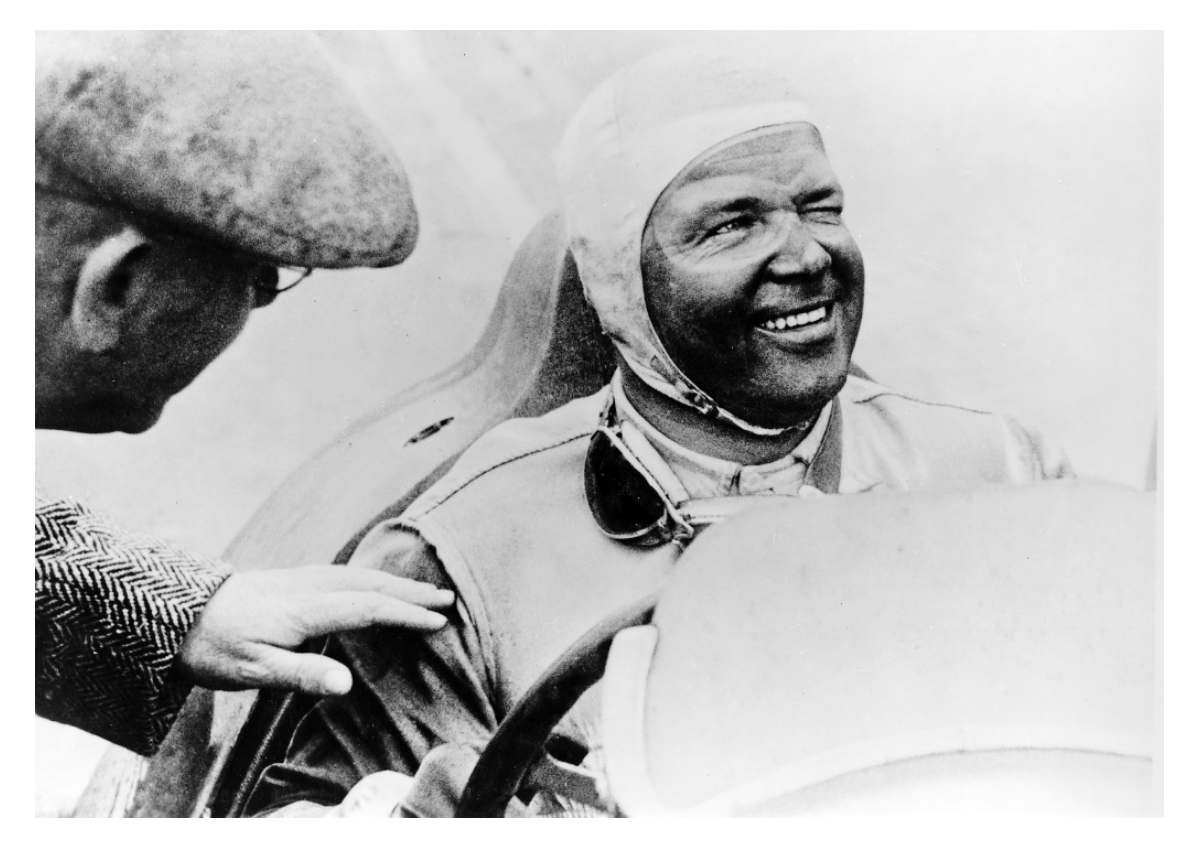
Rudolf Caracciola, 1938

Like the SLS AMG model today, many prospective buyers of the SSK model wanted the high-performance Mercedes-Benz offered, but not in a race-ready package. That is why some SSKs were ordered with a cabriolet body, something that is still in the cards for the modern SLS AMG. Just as Mercedes-Benz was happy to customize your SSK in 1928, AMG will be happy to customize the performance of your SLS AMG today.